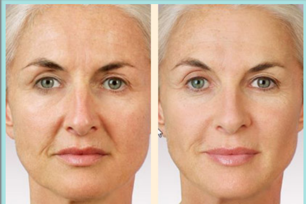
JUVÉDERM VOLUMA® XC